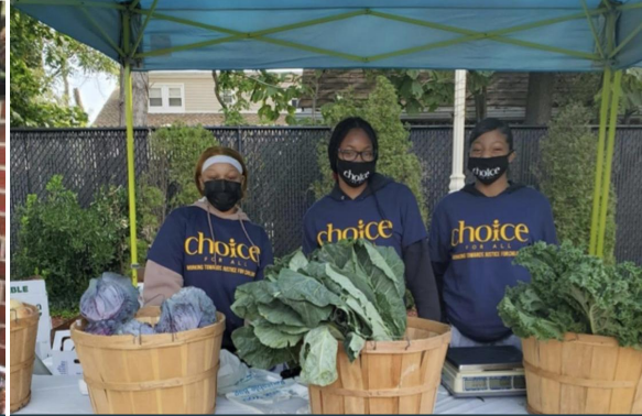
Youth Farmers Market Expansion