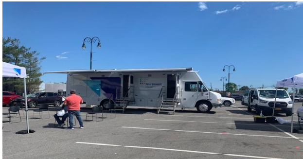
COVID-19 Vaccine Education & Vaccination Sites