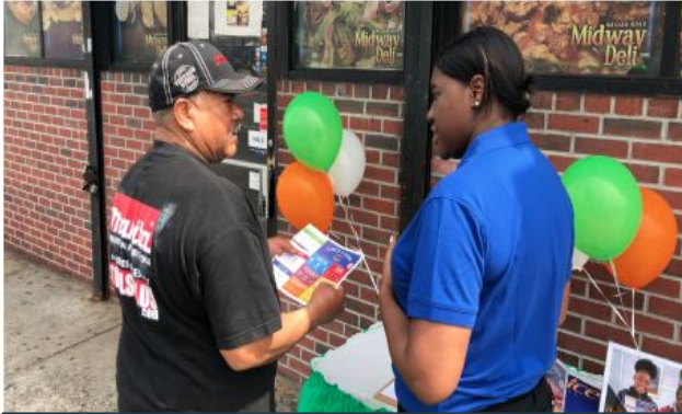
Healthy Corner Store Network