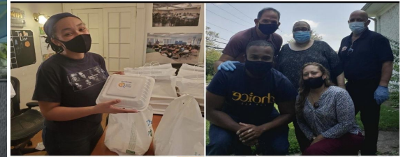
Senior Healthy Restaurant Meal Program