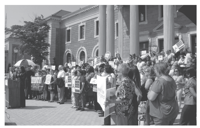
HWCLI members and supporters rally for prompt contracting and payment in Nassau County

While the contracting and payment process has had some improvements, HWCLI's members remain united and committed to a long-term solution to timely contracting and payment that ensures the delivery of critical services to Nassau County's veterans, seniors, children and families